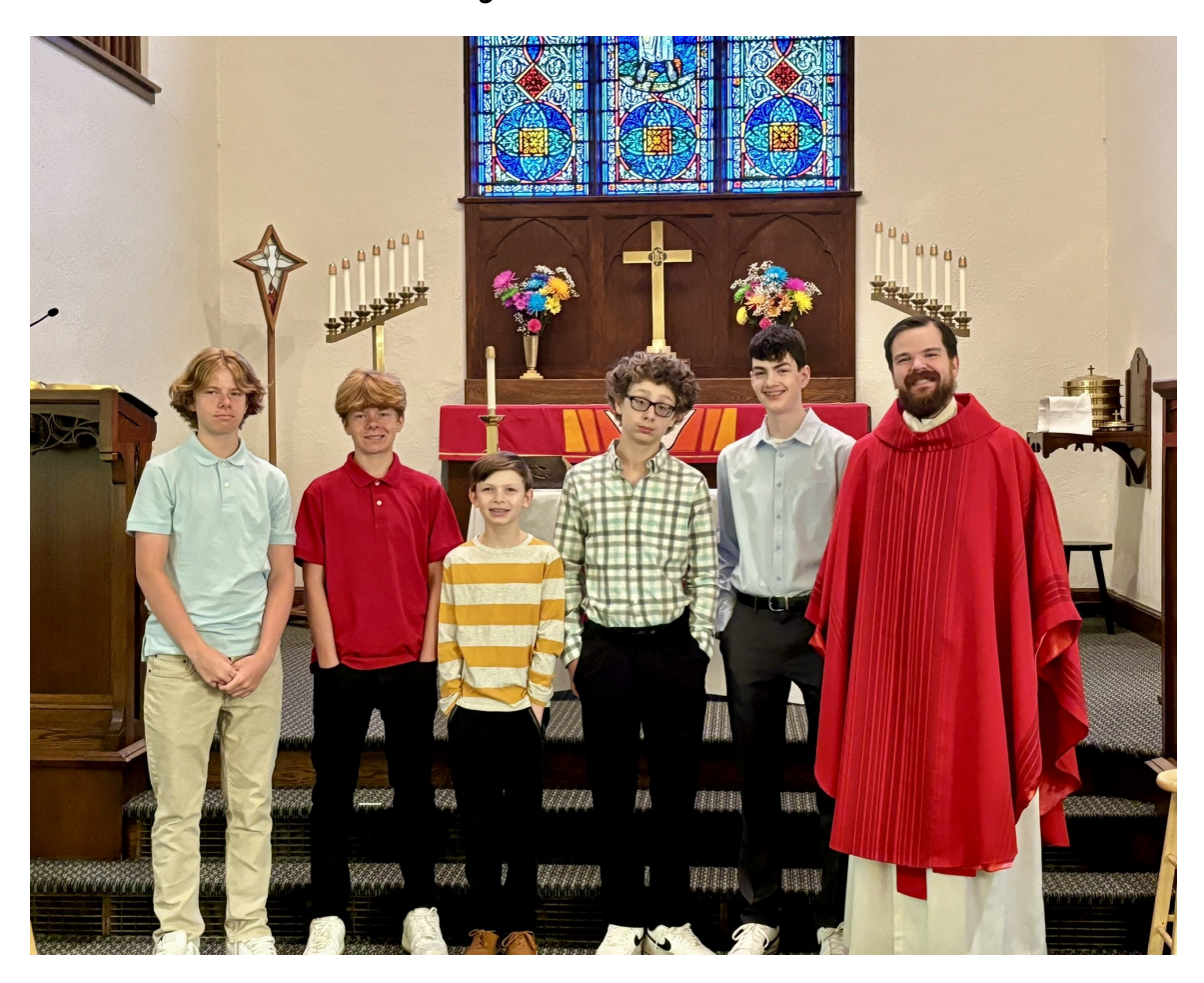
Two Photos from our Service Activities June 23, 2024